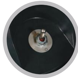
• On/Off Toggle Switch