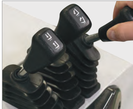
Optional auxiliary lever also shown.