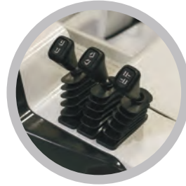
• Manual Hydraulic Function Levers*