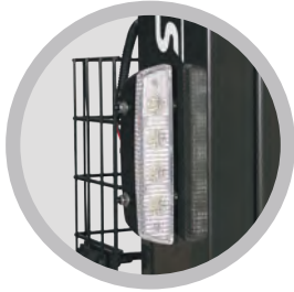
• Mast-Mounted LED Work Lights

We offer a wide range of optional equipment to tailor your UniCarriers stacker to meet the demands of your specific applications and the needs of your operators.