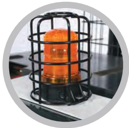
• Strobe Light