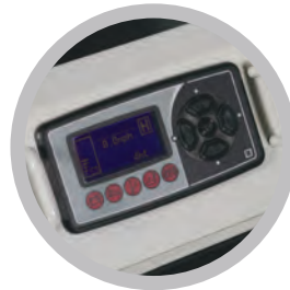
• Multi-Function LCD Display